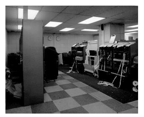
Line Room in the East Block