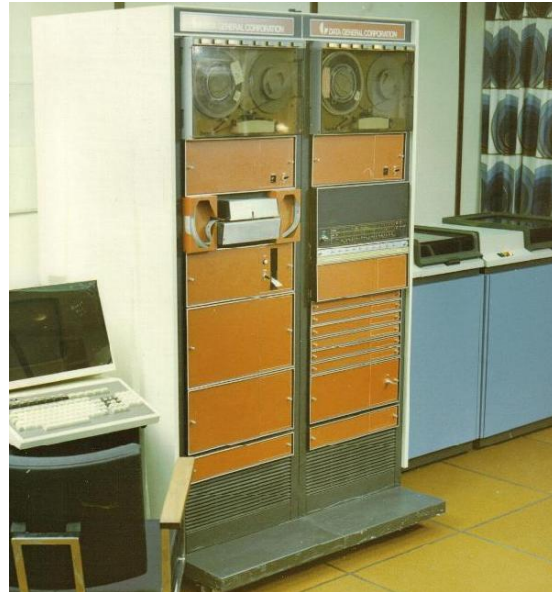
OCAMS in 1974